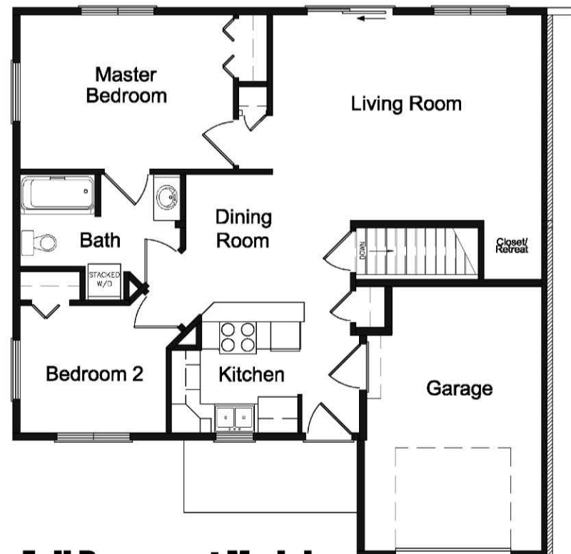
Full Basement Model Floor Plan n.l.s.