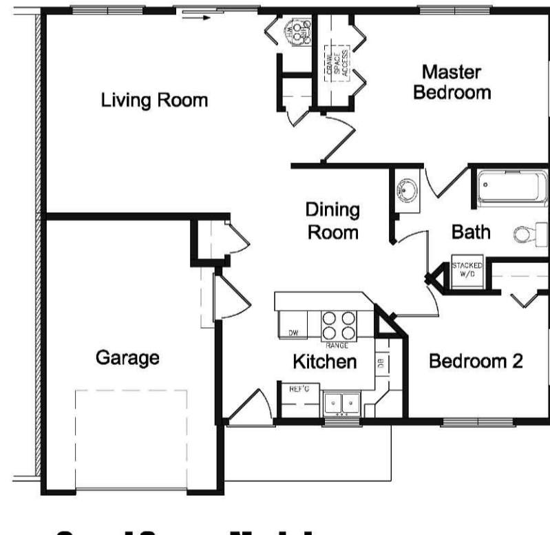
Crawl Space Model Floor Plan n.l.s.